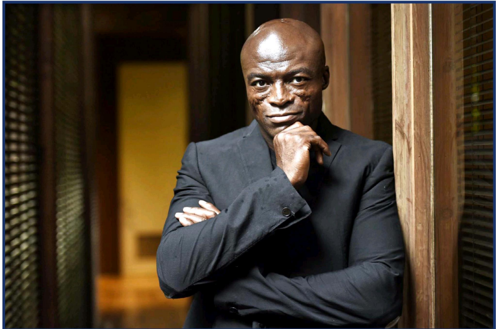
UMCULI waphesheya uSeal ngomunye ophila ne-lupus.

Ukulawula lesi sifo, akhona amaphilisi asetshenziswayo, kodwa i-lupus ivamise